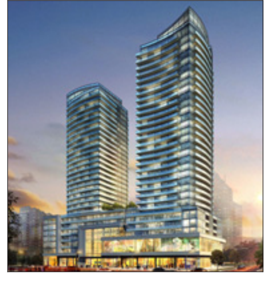
The Madison will consist of 644 condos in two towers connected by an eight-storey podium.

Sales centre: 101 Eglinton Ave. E. (project is still in pre-registration with sales expected to launch this summer). Information: 416-482-8090, www.themadisoncondos.ca