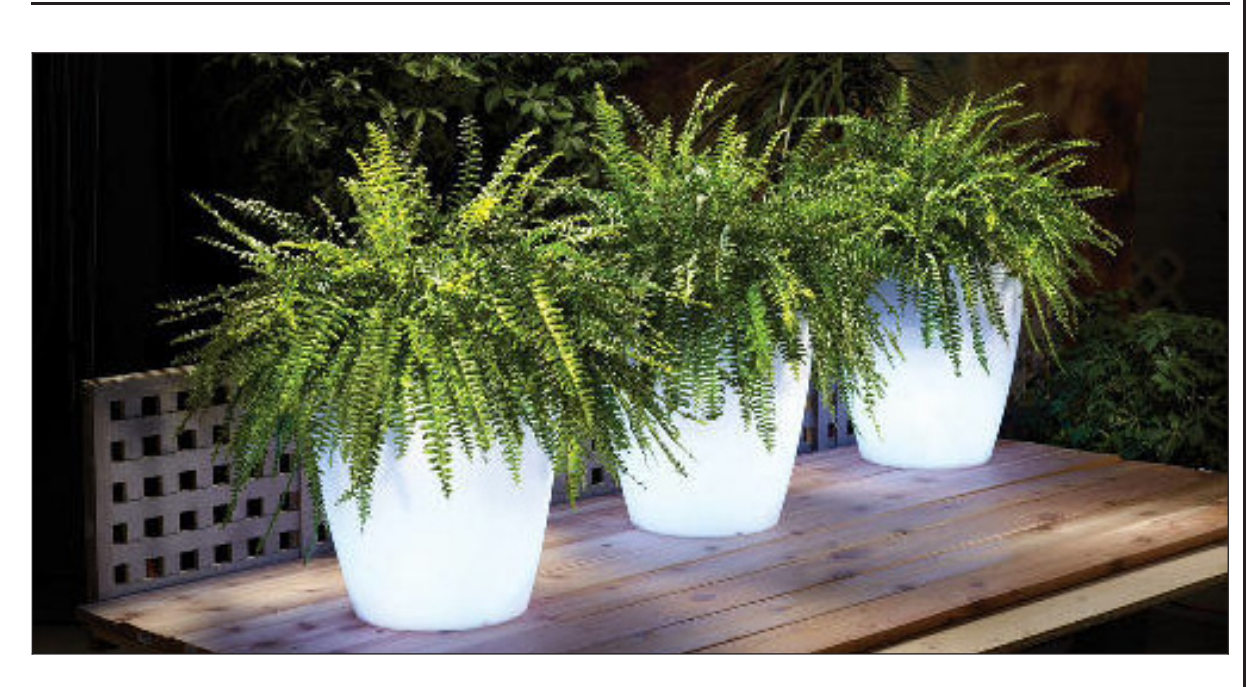
PC's lighted planters sit on a deck, above, and their Simply Salad Bowl's al fresco mix, below.

"With the larger retail coming in, I think there is an opportunity for those other retailers," she says. "They're going to see a spinoff. They'll become healthier and more vibrant because of a greater level of pedestrian activity on Eglinton."