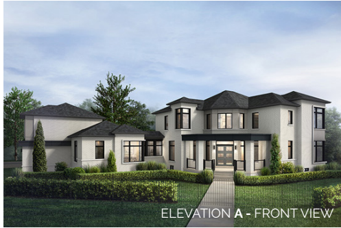
ELEVATION A - FRONT VIEW