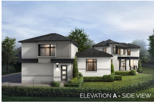
ELEVATION A - SIDE VIEW