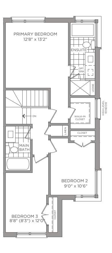
THIRD FLOOR ELEVATION A