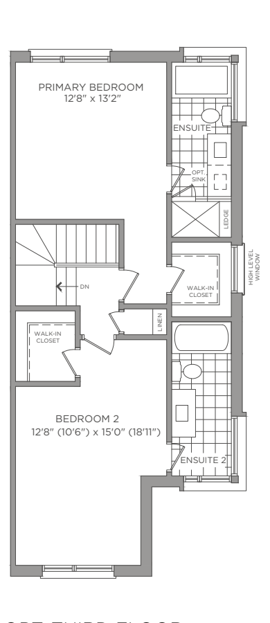
OPT. THIRD FLOOR 2 BEDROOM ELEVATION A